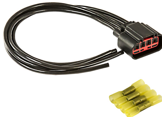
Electrical Connector with Waterproof Butt Connectors #1712341

gpd offers replacement blower motor resistors and pigtail for both the manual and Automotive A/C system