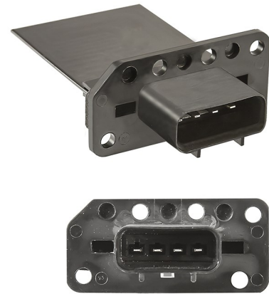
Manual A/C Blower Motor Resistor #1712209