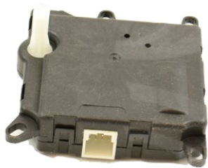
gpd #1711895 2002–2006 Ford Expedition