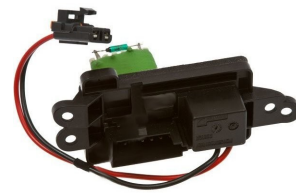
1711735 (without center console)

Manufacturer names, logos and part numbers are for reference only. All prices, taxes and availability are subject to change without notice. This document and any files transmitted with it are confidential and intended solely for the use of the individual or entity to which they are addressed. If you have received this document in error, please delete it immediately. Note that any views or opinions presented in this document are solely those of the author. Any unauthorized review, use, disclosure or distribution is prohibited. GPD accepts no liability for any damage caused by any virus or other means transmitted by this document.