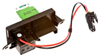
1711711 (with center console)