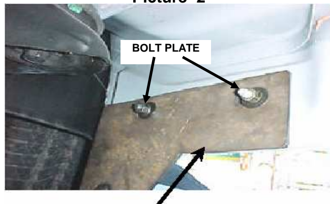
Front Main bracket