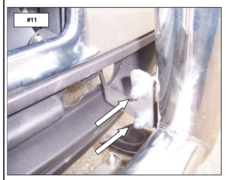
Step-5 Attach the Rhino Charger bar to the mounting brackets using (2) 3/8" x 1" carriage bolts, (2) 3/8" flat washers, (2) 3/8" lock washers and (2) 3/8" hex nuts for each side. Photo #11 & #12