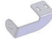
Bracket, passenger side.