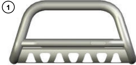
Bull Bar / Dakar Sport