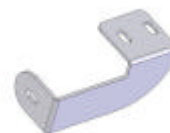
Bracket, passenger side.