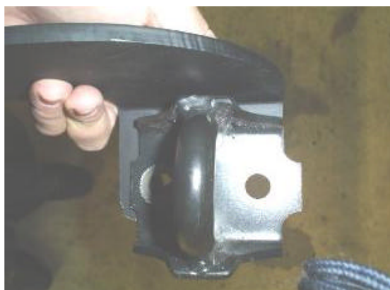
Bracket and tow hook. Passenger side.