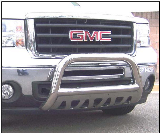
Please do not return this product to place of purchase.