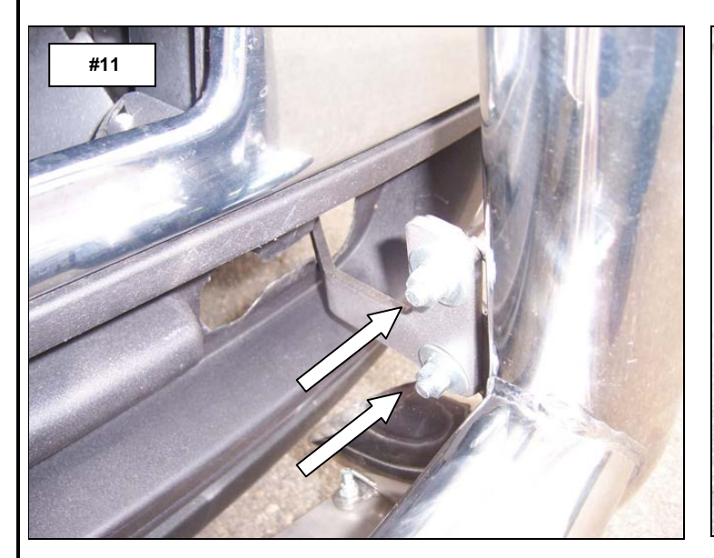
Step-5 Attach the Rhino Charger bar to the mounting brackets using (2) 3/8" x 1" carriage bolts, (2) 3/8" flat washers, (2) 3/8" lock washers and (2) 3/8" hex nuts for each side. Photo #11 & #12