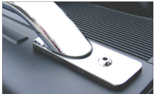
product installed >