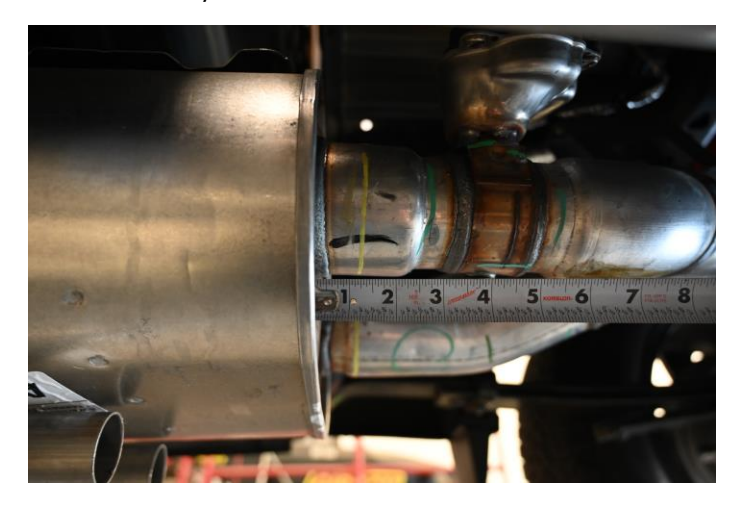
2) FIRST, CUT BOTH OUTLET PIPES 1.25" FROM THE FACE OF THE MUFFLER (NOT THE LIP).

1. Disconnect the negative battery cable before removal of OEM exhaust. This will allow the computer to reset and recognize the new exhaust. Lay out the exhaust on the floor so it looks like the drawing and compare parts with manual.