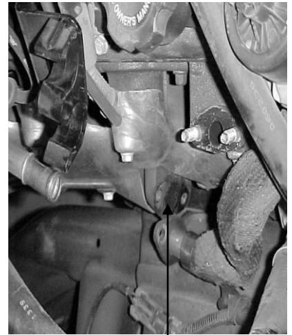
EGR TUBE FITTING

11) FINALLY, MAKE SURE ALL BOLTS ARE TIGHT AND EVERYTHING IS RE-CONNECTED. START THE ENGINE AND LET IT WARM UP. CHECK FOR LEAKS. TURN ENGINE OFF AND MAKE SURE ALL BOLTS ARE TIGHT.