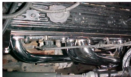
FLANGE SPACER STUD/W WIRELOOM

8) IF YOUR VEHICLE DOES NOT HAVE AN O2 SENSOR IN THE REAR OF THE MANIFOLD, USE THE SUPPLIED PLUG TO SEAL THE O2 SENSOR FITTING IN THE COLLECTOR OF THE DRIVER SIDE GIBSON HEADER. PREPARE HEADER BOLTS BY APPLYING ANTISEIZETO THE THREADS. ON DRIVERS SIDE USE (5) 3/8" X 1" BOLTS AND LOCK WASHERS SUPPLIED. REUSE ONE OF THE STUDS IN THE FRONT HOLE OF THE #1 PORT. APPLY A THIN COAT OF SEALANT TO THE COLLECTOR DOME WHERE IT MEETS THE LOWER FLANGE. (WE SUGGEST PERMATEX ULTRA-COPPER HIGH TEMP SEALANT.) BOLT HEADER TO THE HEAD USE THE SUPPLIED BOLTS AND WASHERS ON THE REAR 5 HOLES. DO NOT USE A BOLT ON THE FRONT HOLE OF THE #1 PORT. THIS IS WHERE THE STUD GOES. USE SUPPLIED 1" TUBULAR SPACER BETWEEN THE HEADER FLANGE AND THE STUD SHOULDER ON THE FRONT HOLE. TORQUE ALL 6 BOLTS TO APPROXIMATELY 30-35 LBS.