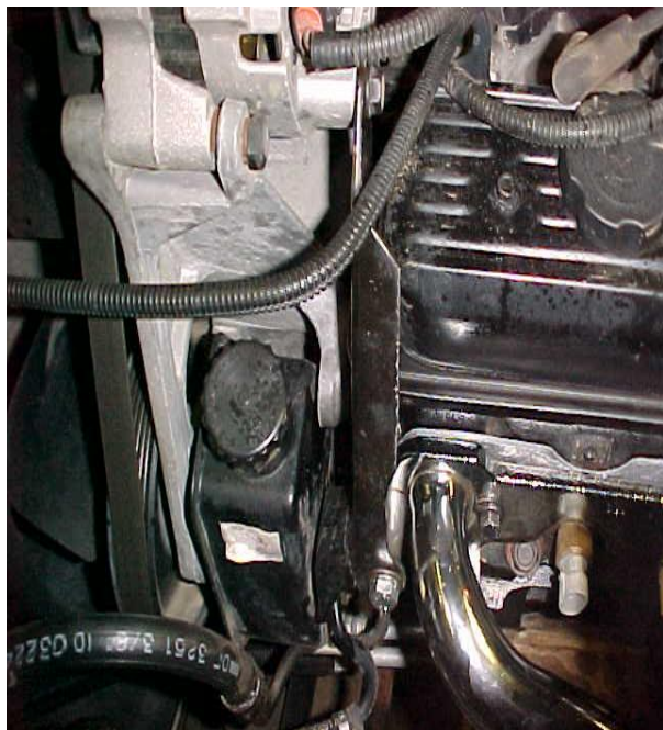
THIS IS A VIEW OF THE MODIFIED BLACK STEEL BRACKET INSTALLED.

10) TO REINSTALL WIRELOOMS,USE SUPPLIED 1/2" TUBULAR SPACE AND 1/4" BOLT.THE SPARK PLUG LOOM WILL NOW SIT OUTWARD OF THE HEADER FLANGE RATHER THAN AGAINST THE HEAD. IF EQUIPPED ,RE-INSTALL THE O2 SENSER. (REFER TO PICTURE ABOVE FOR A VISUAL OF WHERE THE WIRELOOM INSTALLS AT.)