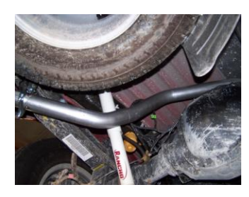
7. Install the driverside overaxle tailpipe #D into the muffler 1½-2". Use clamp #H to secure. DO NOT TIGHTEN. Rotate until it meets with metal hanger, use clamp #H to hold pipe. DO NOT TIGHTEN.

6. Install metal hanger #I into hole located approximately 19" from the rear of the frame in the second hole from top. Use bolt kit #J to secure. DO NOT TIGHTEN.