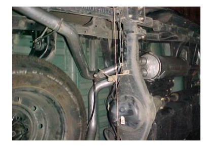
INSTALL PASS. SIDE TAILPIPE # D INTO MUFFLER 1-1/2" TO 2" USE CLAMP # I TO SECURE PIPE TO MUFFLER, DO NOT TIGHTEN. INSERT HANGER INTO RUBBER GROMMET.