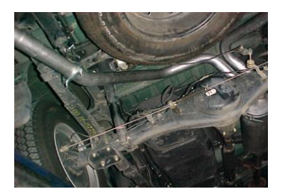
INSTALL THE DRIVERSIDE OVER AXLE TAILPIPE #C ONTO MUFFLER 1-1/2" TO 2" USE CLAMP # I TO SECURE PIPE TO MUFFLER, DO NOT TIGHTEN.

REMOVE STOCK EXHAUST BY UN-CLAMPING THE STOCK CLAMP AT THE HEADPIPE. BE CAREFUL NOT TO DAMAGE THIS CLAMP BECAUSE YOU NEED TO RE-USE IT. ONCE IT IS UN-CLAMPED, YOU WILL BE ABLE TO PULL THE STOCK EXHAUST OFF THE VEHICLE. MAKE SURE ALL FACTORY RUBBER GROMMETS ARE STILL IN FACTORY LOCATION. USE WD-40 TO AID YOU IN REMOVAL OF THE HANGERS