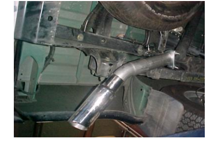
INSTALL EXIT PIPES # E ONTO TAILPIPES USE CLAMP # I TO SECURE PIPES TOGETHER CLAMP ON, DRIVERS SIDE WILL HOOK UP TO THE REAR HANGER TO HOLD PIPES UP.

INSTALL HEADPIPE #A ONTO THE FACTORY EXTENSION PIPE. MAKE SURE THAT THE HEADPIPE IS STRAIGHT, NOT ANGLED UP OR DOWN. YOU MAY WANT TO LIGHTLY TAP ON THE END OF THE PIPE TO ENSURE A TIGHT FIT. CLAMP DOWN THE FACTORY CLAMP AT THE FRONT OF THE HEADPIPE. DO NOT TIGHTEN.