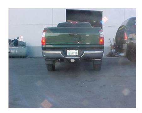
INSTALL STAINLESS TIPS. CLAMP DOWN. WHEN YOU HAVE EVERYTHING IN PLACE, FIRMLY TIGHTEN ALL BOLTS AND CLAMPS DOWN SECURELY. TO CLEAN TIPS, USE A STAINLESS STEEL CLEANER AND A SCOTCH BRITE PAD.