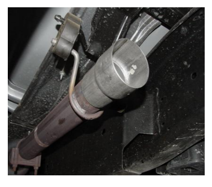
INSTALL HEADPIPE #A, LINE UP THE NOTCH USE CLAMP #D TO SECURE HEADPIPE TO YOUR FACTORY PIPE. DO NOT TIGHTEN.

INSTALL MUFFLER ASSEMBLY #B ONTO HEADPIPE 1-1/2" TO 2". SLIDE WELDED HANGERS INTO RUBBER GROMMETS YOU MAY NEED TO ADJUST WELDED HANGERS TO FIT INTO YOUR GROMMETS. USE A JACKSTAND TO SUPPORT YOUR MUFFLER. USE CLAMP #C TO SECURE IT TO YOUR HEADPIPE. DO NOT TIGHTEN.