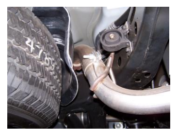
3. For easier removal of the stock exit pipe, remove rear hanger from the frame. Then remove exit pipe and re-install stock rear hanger.

7. Install the over axle tailpipe #C into the extension pipe 1\frac{1}{2}-2^{"} . Use clamp #E to secure. Do not tighten. Insert welded hanger into the rubber grommet.