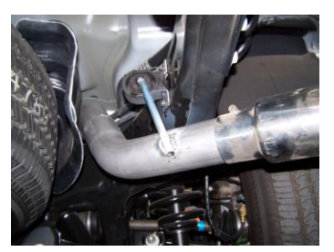
8. Install the exit pipe #D on the tailpipe. Secure together with clamp #E. Do not tighten. Roll the exit pipe until it is at the correct angle for your truck. Insert the welded hanger into rubber grommet.