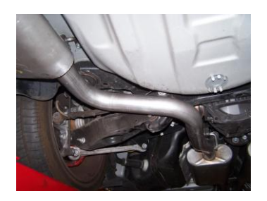
4. Install driver side tailpipe/muffler assembly #B. Insert all welded hangers into rubber grommets. Secure tailpipes with clamp #D. Do not tighten.

GIBSON EXHAUST systems are designed on a factory stock vehicle. Any aftermarket products installed could increase the sound levels of the exhaust. Make sure there is a 1" clearance from ALL rubber brake lines, shock boots, lines, tires, etc. to prevent heat related damage or fire.