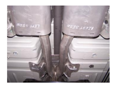
3. Install X pipe assembly #A assembly on to your front factory pipes and secure with factory clamps. Re-install factory cross member. Use a jack stand to support mufflers. Do not tighten.

6. Install passenger side tailpipe/muffler assembly #C. Insert all welded hangers into rubber grommets. Secure tailpipe with clamp #D. Do not tighten. Now go back and make sure the first two mufflers in the middle are level.