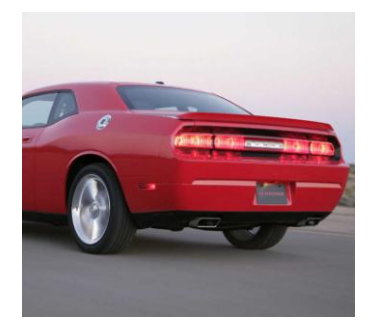
7. Re Install Stock Tips. Use stainless steel cleaner and a Scotch Brite pad weekly to prevent tips from discoloration. Inspect all fasteners after 25-50 miles of operation and retighten as necessary.