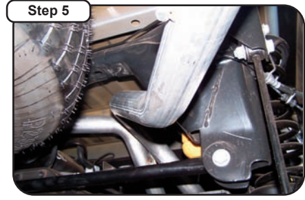
Install tail pipe #C into muffler 1 1/2" to 2". Use clamp #E to secure. Do not tighten. Insert welded hangers into rubber grommets.