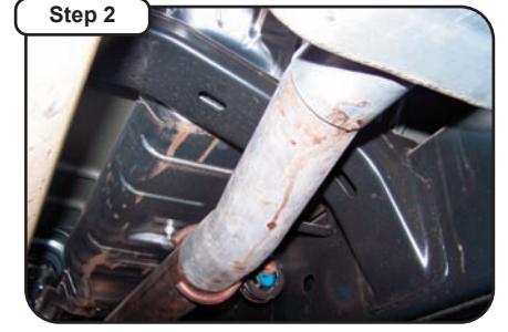
Install head pipe # A onto your existing stock front pipe and attach with clamp #E. Do not tighten . Insert welded hanger into rubber grommet.

To remove the stock exhaust, remove your factory exit pipes. Next, remove your tailpipe by unbolting from the back of your stock muffler. Remove your factory muffler from the clamp in front of it. Use WD-40 to aid in removal of facotry grommet that will be re-used.