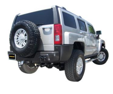
8. Install stainless steel tip. Clamp down. When you have everything in place, firmly tighten all bolts and clamps down securely. Use stainless steel cleaner and a Scotch Brite pad weekly to prevent tip from discoloration. Inspect all fasteners after 25-50 miles of operation and re-tighten as necessary.

4. Install muffler #B onto headpipe 11/2"-2" with the louvers facing towards the converter. Use a jack stand to support the muffler. Use clamp #E to secure the muffler to the headpipe. DO NOT TIGHTEN. Muffler inlet is looking into the louvers. Outlet of muffler will be at approximately 12 o'clock.