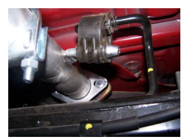
3. Install headpipe #A onto your existing stock flange using bolt kit #F to secure flange. DO NOT TIGHTEN. Insert welded hanger into rubber grommet.