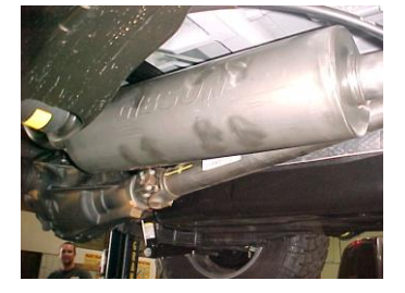
3. Slide muffler #A onto headpipe 1\frac{1}{2} "-2". Use a jack stand to support the muffler. Make sure muffler outlets are level. Use clamp #G to secure the muffler to the headpipe. Do not tighten.

5. Slide the second driver side over axle tailpipe #C onto pipe #B 1.5-2". Secure pipes using clamp #F. Do not tighten. Insert welded hanger into rubber grommet.