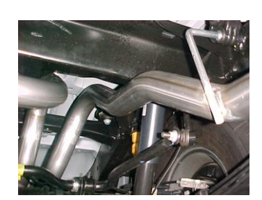
6. Slide the passenger side tailpipe #D into muffler 1.5-2". Insert welded hanger into rubber grommet. Use clamp #F to secure tailpipe to muffler. Do not tighten.