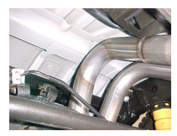
4. Slide driver side over axle tailpipe #B into muffler 1.5-2". Use clamp #F to secure tailpipe to muffler. Do not tighten. Insert welded hanger into rubber grommet.