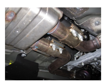
1. To remove your stock exhaust, unbolt it from the clamps located just after the manifolds then remove the whole exhaust system

1. Disconnect the negative battery cable before removal of OEM exhaust. This will allow the computer to reset and recognize the new exhaust. Lay out the exhaust on the floor so it looks like the drawing and compare parts with manual.