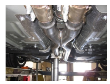
2. Install your Gibson x-pipe using the stock clamps

4. Now do the same procedure for the driver side. Use clamp # D to secure to the muffler.