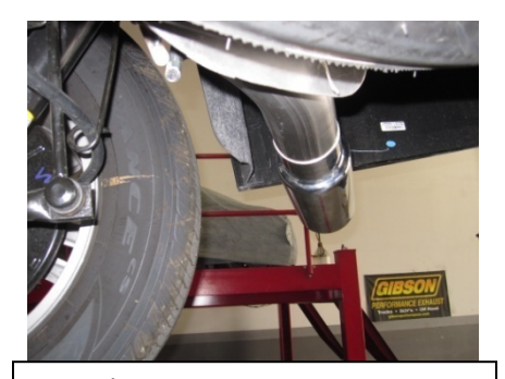
6. With proper clearance from spare tire install the exhaust tip onto the tailpipe. The system was designed to have the tip 1" below the quarter panel of the vehicle. With the tip in your desired position begin to tighten down all clamp connections from the