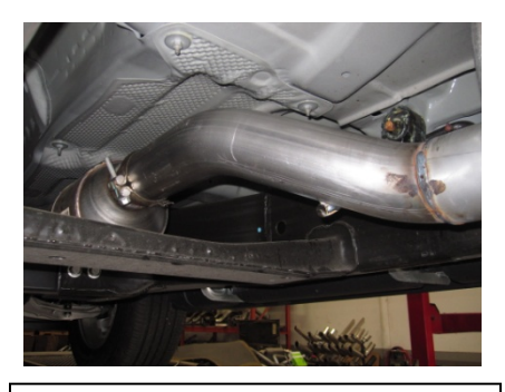
1.Install headpipe #A onto your factory pipe using your stock clamp insert welded hanger into the rubber grommet leave clamp loose.

1. Disconnect the negative battery cable before removal of the OEM Exhaust. This will allow the computer to reset and recognize the new exhaust. Lay out the exhaust on the floor so it looks like the drawing and compare parts with manual. Remove the factory exhaust by cutting behind the factory muffler. Once the tail pipe has been removed un-bolt the muffler and head pipe at the clamp located in front of the factory muffler. Use wd-40 or another type of penetrating oil to remove the rubber grommets. Do not damage these they will be re used.