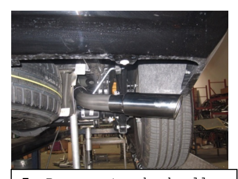
7. Be sure to check all clearance after each section has been tightened to be sure there is proper clearance. It may take 4-500 miles for your vehicle to fully adjust to the changes in exhaust flow.

"MAKE SURE YOU HAVE A 1" CLEARANCE ON ALL PIPES FROM ALL RUBBER BRAKE LINES, SHOCK BOOTS, TIRES, ETC..." TORQUE ALL CLAMPS TO APPROX. 100 TO 150 FT LBS.