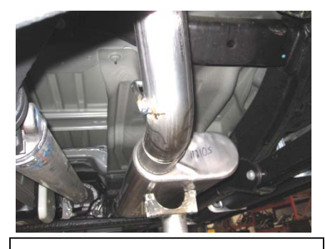
4. Install over axle pipe Item # C into the muffler outlet. Slip the hangers into the rubber grommets and keep tailpipe loose use clamp #E to secure together.