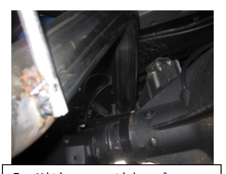
5. With everything loose you may need to adjust the system for proper clearance of shocks, brake lines, ect.