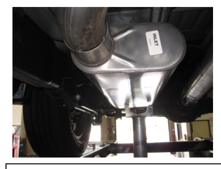
3. Install muffler #B onto headpipe 1.5" to 2" muffler should be level use clamp #E to secure together do not tighten.