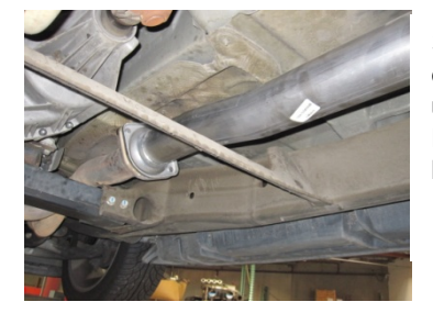
3. Install head pipe #A onto your existing stock flange and attach using the stock hardware. DO NOT TIGHTEN. Insert welded hanger into rubber grommet.