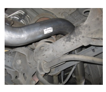
5. Install tailpipe #C into muffler 1½-2" and secure with clamp #F. DO NOT TIGHTEN. Insert welded hanger into rubber grommet.

2. Remove the stock exhaust by removing it from the 2-bolt flange located in front of the muffler. Disengage the welded hangers using WD-40 from the OEM rubber grommets. Do not damage stock nuts and bolts or remove the rubber grommets as you will reuse them to mount your new system. Now, cut off tailpipe and remove exhaust.