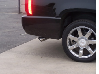
7. Install stainless steel tip #E. Clamp down. When you have everything in place, firmly tighten all bolts and clamps down securely. Use stainless steel cleaner and a Scotch Brite pad weekly to prevent tip from discoloration.

4. Install muffler #B onto head pipe 1½"-2" with the louvers facing towards the converter. Use a jack stand to support the muffler. Use clamp #F to secure the muffler to the headpipe. DO NOT TIGHTEN. Muffler inlet is looking into louvers.