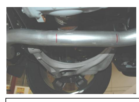
2. To remove the driver side exhaust measure 8" from the bend located under the rear end forward. Mark and cut with a hack saw or cut off wheel. Leave the factory rubber grommets in place they will be re used.

1. Disconnect the negative battery cable before removal of the OEM Exhaust. This will allow the computer to reset and recognize the new exhaust. Lay out the exhaust on the floor so it looks like the drawing and compare parts with manual. Be sure all part numbers and your vehicle model match the instruction manual before removing your factory exhaust.