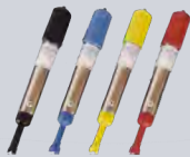
CT8002 Professional Cordless Computer-Safe Circuit Tester