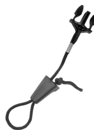
ACO-0904 Standard CB Mic Lanyard (Fits RT2/RT4 Series)