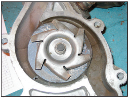
CAVITATION / CORROSION