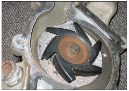
CAVITATION / CORROSION