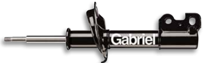
Ultra™ Struts (G52000/G55000/G56000 Series)