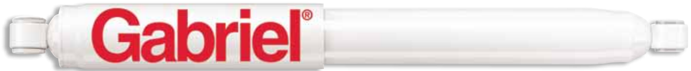
Ultra™ LT Shock Absorbers (G63000/G64000 Series)