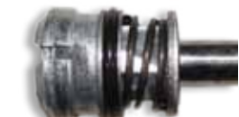
Durable valve design adjusts for wear