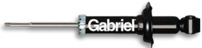
Ultra™ Spring Seats (G51000 Series)