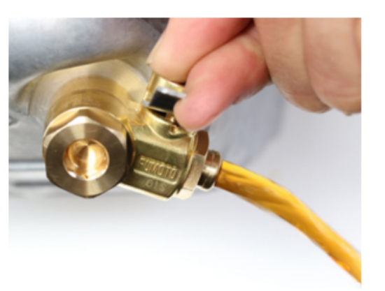
A larger body and quad channels allow for better flow rates and faster oil changes in some of our most popular sizes.