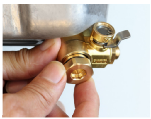
The versatility of the SX-series valve allows installation without an adapter on some cars and trucks that may have previously required one.