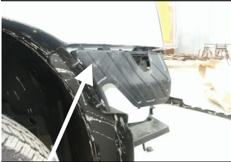
Step 1 Remove plastic shield above chrome bumper

Step 1: Remove factory bumper + Factory plastic shield above the chrome bumper. Note: Do not remove factory tow hooks.