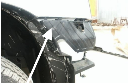
Step 1 Remove plastic shield above chrome bumper

07-13 GMC 1500 & 07-10 2500HD-3500HD FBR Installation Instructions. (1500) Part # 300-30-7008, (2500HD-3500HD) Part # 300-30-7005. XFBR (1500) Part # 600-30-7009, XFBR (2500HD-3500HD) Part # 600-30-7005