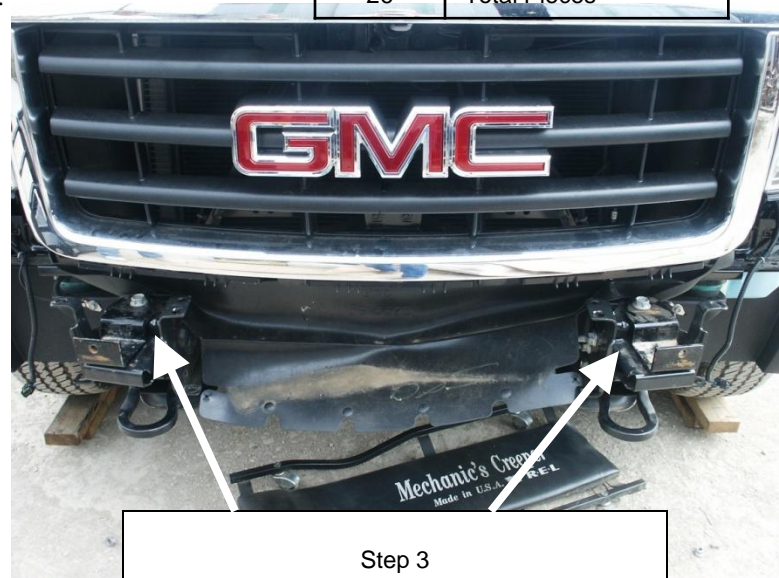
Step 3 Frame support bracket installed

Step 5: Install bottom foot of Grille Guard to the outside tow hook bolts.