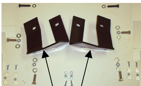
Frame Support Bracket