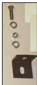
Angle bracket & bolts used on 1500 series only