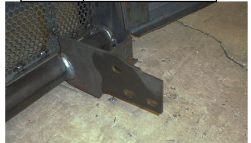
Front Bumper Replacement Bracket

Step 3: Mount front bumper replacement (not shown) to frame. Front bumper replacement bracket aligns to the inside of the vehicle frame rails (see picture).