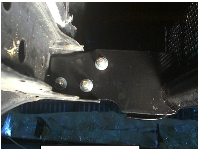
Driver Side Frame