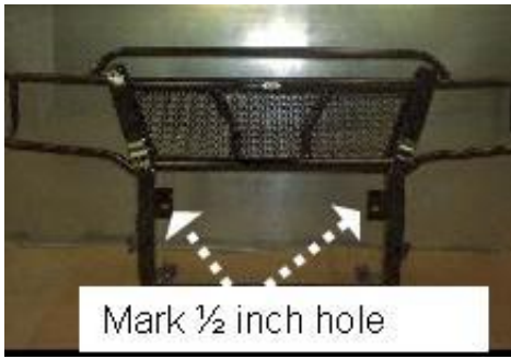
Mark 1/2 inch hole

Step 1: Install Bumper Support Bracket between frame horn and back of chrome bumper. Loosen bolts that hold the bumper (2 per side) to the frame. Warning: Only loosen bolts enough for bracket to fit over, do not remove! Slide bracket behind loosen bolts on frame. Retighten bolts.