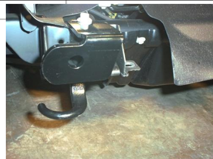
Passenger Side with bumper support bracket installed

Step 1: Remove lower bumper support bolt located on the engine side of frame. (Note: Do not remove factory bumper). Install Frontier bumper support bracket behind bumper and to the top of frame. Insert bolt and slide bumper support bracket forward to the backside of the chrome bumper. Tighten bolt. (Hint – Brackets should point away from each other when placed against the back of the factory bumper.)