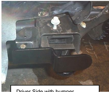
Driver Side with bumper support bracket installed