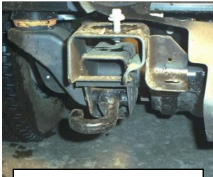
Passenger Side without bumper support bracket installed

Step 3: Align grille guard to truck and drill 1/2 inch hole through chrome bumper and bumper support bracket installed in step 1.