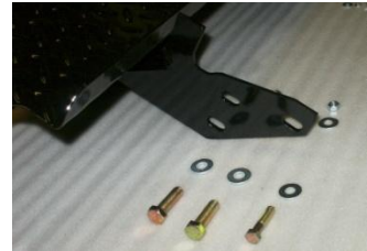
Bracket Side View