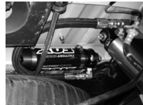
Fig. 3: Driver side hose orientation