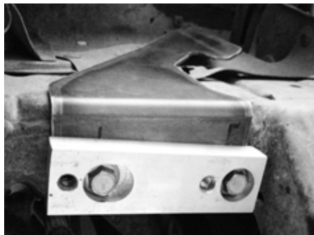
Fig. 3: Driver side sway bar relocation spacer