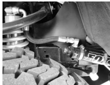
Fig. 2: Passenger side

between vehicle frame and skid plate braces with the supplied longer M10 bolts. Torque to 30 ft*lbs (Fig. 4).