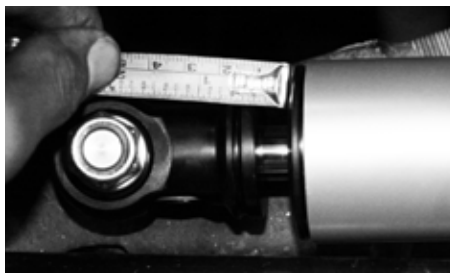
Fig. 2: 1/4" of shaft exposed