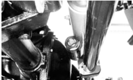
Fig. 5: 135 degree reservoir orientation on some 2012 and newer applications