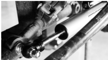
Fig. 3: Eyelet installed on track bar bolt