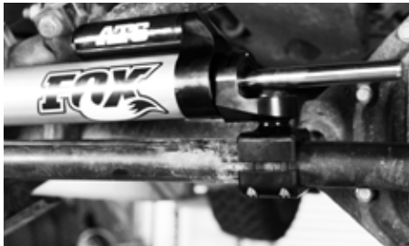
Fig. 4: Stabilizer loosely clamped to tie rod