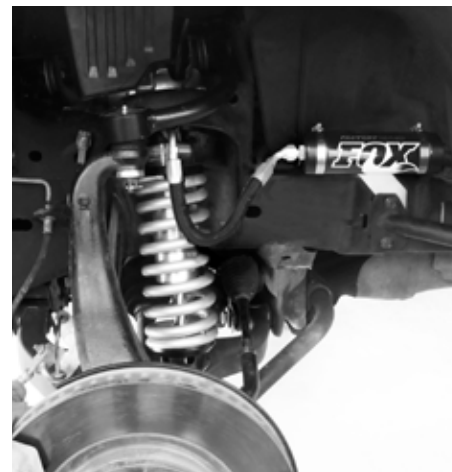
Fig. 2: Passenger side