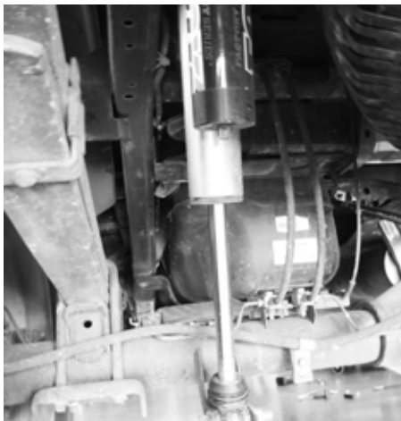
Fig. 4: Driver side

Now measure ride height and make adjustments if necessary. READ INSTALLATION GUIDELINES ON HOW TO PROPERLY ADJUST PRELOAD