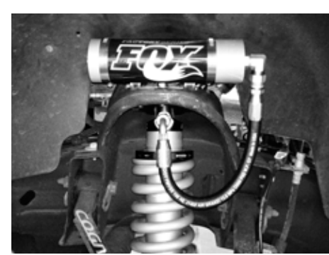
Fig. 3: Driver side

9. Connect the shock assembly to the lower control arm using the (2) bolts