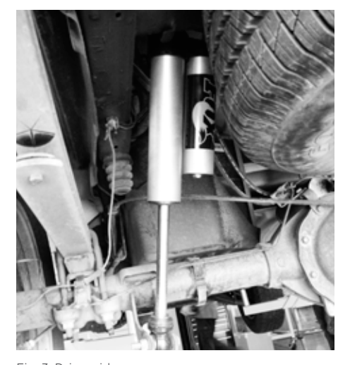
Fig. 3: Driver side