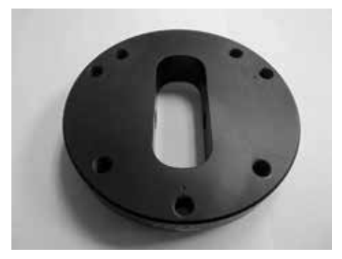
Fig. 2: Correct holes marked with a dot