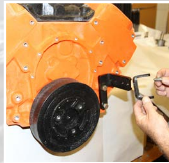
Install pump bracket (1) to L-shaped bracket (2) with bolts (15) and washers (13) supplied