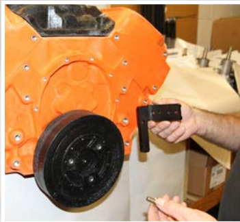
Install L-shaped bracket (2) on engine with bolts (16) and lockwashers (14) supplied