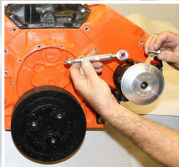
Install adjuster to pump using bolt (9) and washer (10) supplied