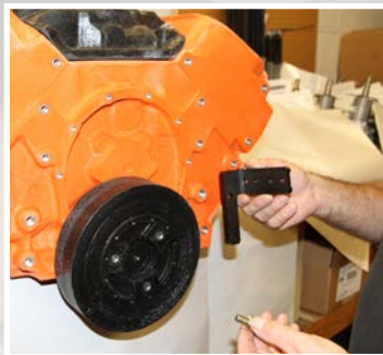
Install L-shaped bracket (1) on engine with bolts (15) and lockwashers (11) supplied