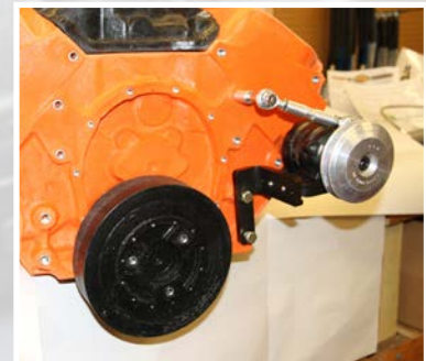
Remove upper water pump bolt. Install spacer (6) and adjuster with bolt (7) and washer (8) supplied