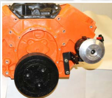
Install pump to bracket (2) using bolts (9) and washers (10) supplied