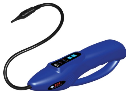
Part # 5110 FJC Electronic Leak Detector

WARNING: We warranty this product to perform as stated in these directions. As we cannot control the use of this product, the guarantee shall not exceed the purchase price. We make no other warranty of any kind expressed or implied. All warranties expressed or implied including warranties on merchantability and fitness of purpose are null and void if the equipment is altered, damaged or misused in any way or if equipment is not repaired by authorized repair station using authorized parts.