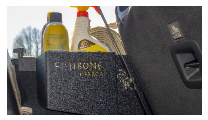
ENJOY YOUR NEW FISHBONE OFFROAD STORAGE BINS!

Push the bin's bracket under the pillar and over the bolt threads until it sits evenly with the tub rail.