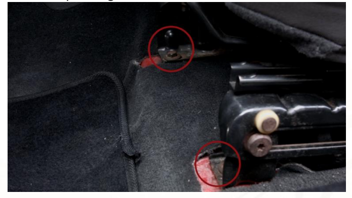
Remove them with a 13MM Socket.

Locate the two front-most seat bolts on either the driver or passenger side.