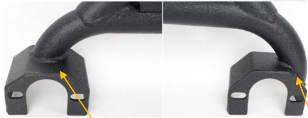
FRONT - Tube in middle