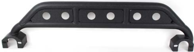
Passenger side shown

To identify the front and rear of the part, which will help identify driver and passenger, see images below: