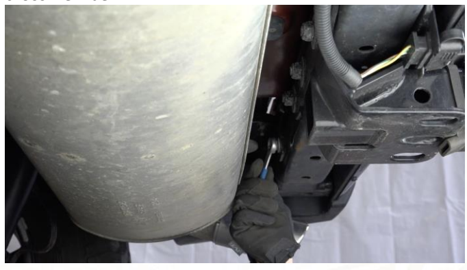
Remove the 2 16mm bolts between the body and bumper.