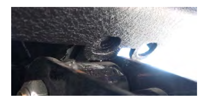
For a YJ , simply install the lower hardware and proceed to tightening all hardware.

For a CJ, place the supplied spacers underneath the frame between the frame and bumper, to fill the gap. Install the remaining hardware underneath and proceed to tightening all hardware using a 19mm wrench.