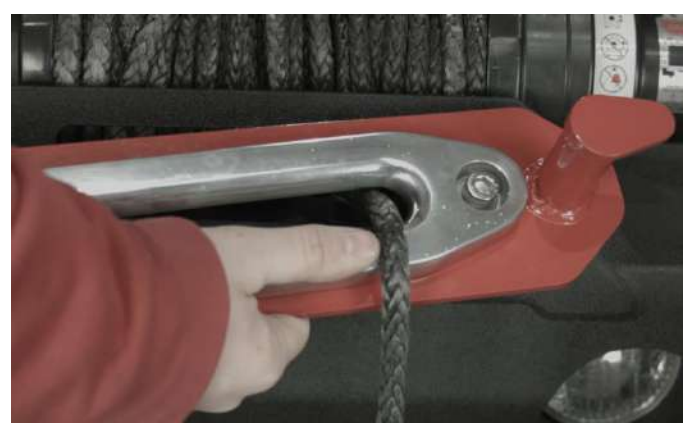
Holding the two parts together, place them up to your bumper and into place using the two included bolts lead by a flat washer.

Fits Standard Fairleads Winch Line "Fishhook"