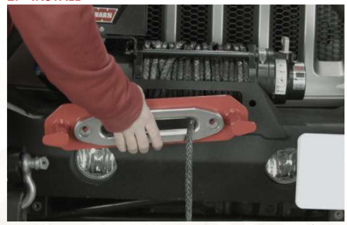
Slide your synthetic rope through the Fishhook's cable slot followed by your winch's fairlead.