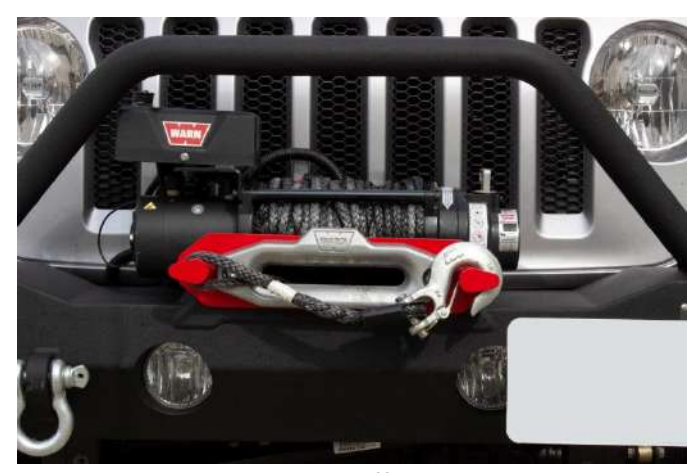
Enjoy your Fishbone Offroad Winch Line "Fishhook"!

Wrap the excess synthetic rope around the rope support and resecure your winch hook.